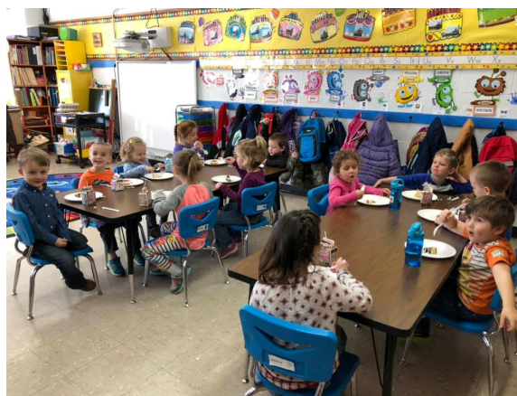
Preschool enjoy snack