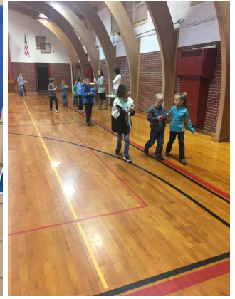
Grade School students are walking laps in the mornings to get across the state. They've logged 132.70 miles in 8 days!