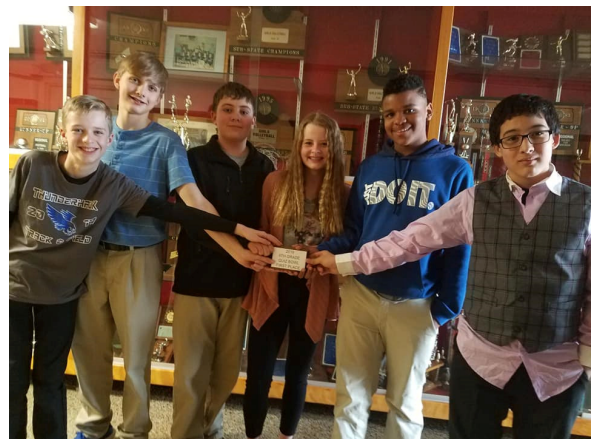
Thunderhawk 8th grade scholars' bowl team were WKLL Champs.